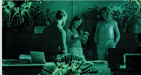
WHAT YOU BREATHE