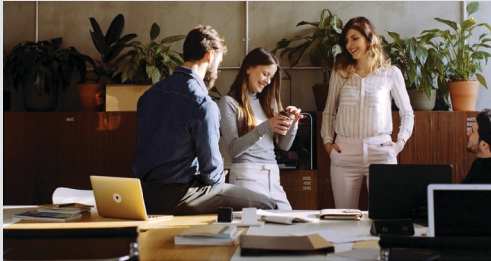
WHAT YOU SEE